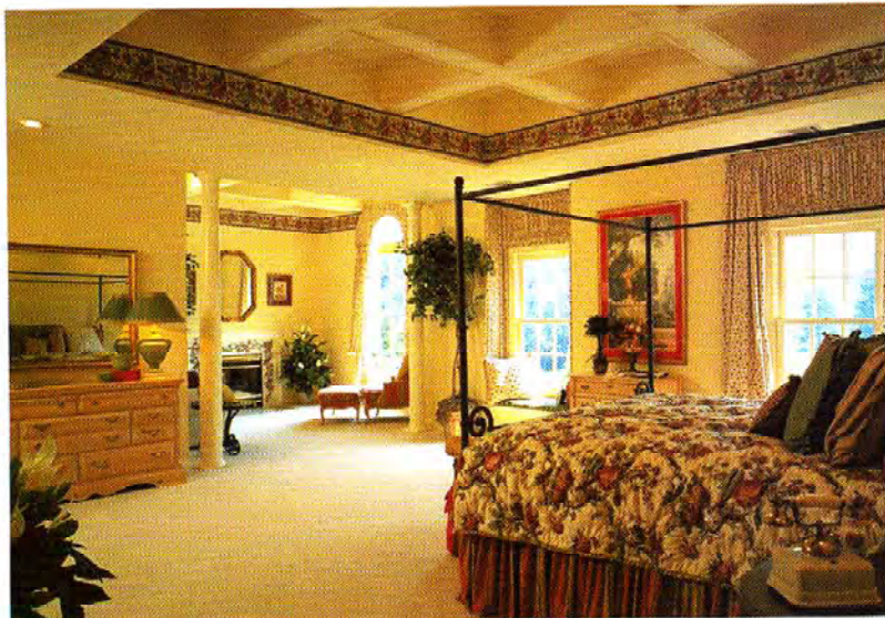
A coffered ceiling adorns the master bedroom of this WCI/Renaissance home.

As you enter the home through stately stained redwood double doors, you'll find the living spaces in the front of the home—living room, dining room and side sunroom—are quietly elegant spaces with an Old World appeal. These rooms overlook the formal entrance with stone pavers and stone walls that designate areas for lawn and gardens. The rooms that overlook the pool, tennis court and terraced landscaping in the rear of the residence capture the essence of the seamless rela-