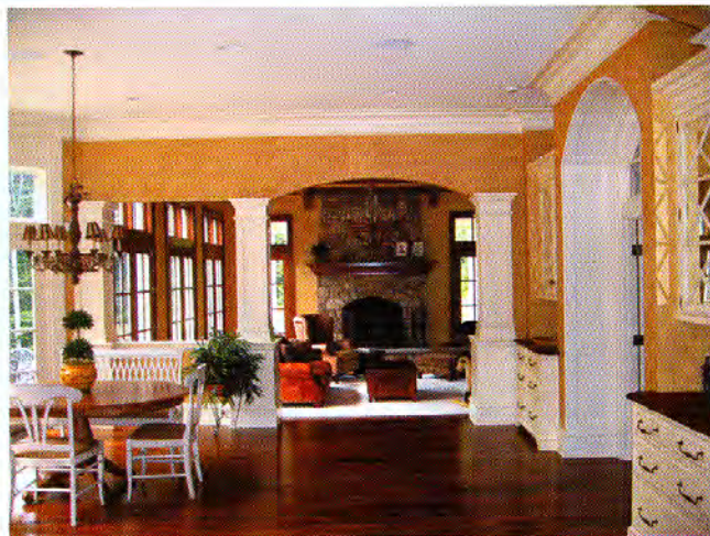
Rich dark wood floors and fine millwork give the home a stately but warm glow.

A custom home is part art, part construction job. It is the work of an architect and a builder and a collection of specialty craftsmen, all informed by the desires and dreams of the homeowner. Its starting point may be notes on a cocktail napkin, sketches on graph paper, pages pulled from a magazine, or a builder's existing design. The custom process, when it works, takes off from that starting point and moves on, incorporating the way the clients and their family will live each day in the house, the way they entertain, the way they see themselves inside the space and the image they wish to project. It combines personalities, living patterns, budgets, materials, time frames and more, to create a house that stands as a monument to the process and a dream come true for the fortunate owners.