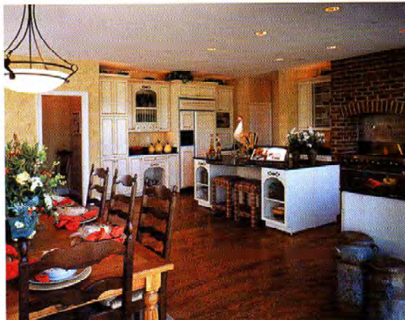
The WCI/Renaissance kitchen boasts two islands and custom built-ins.